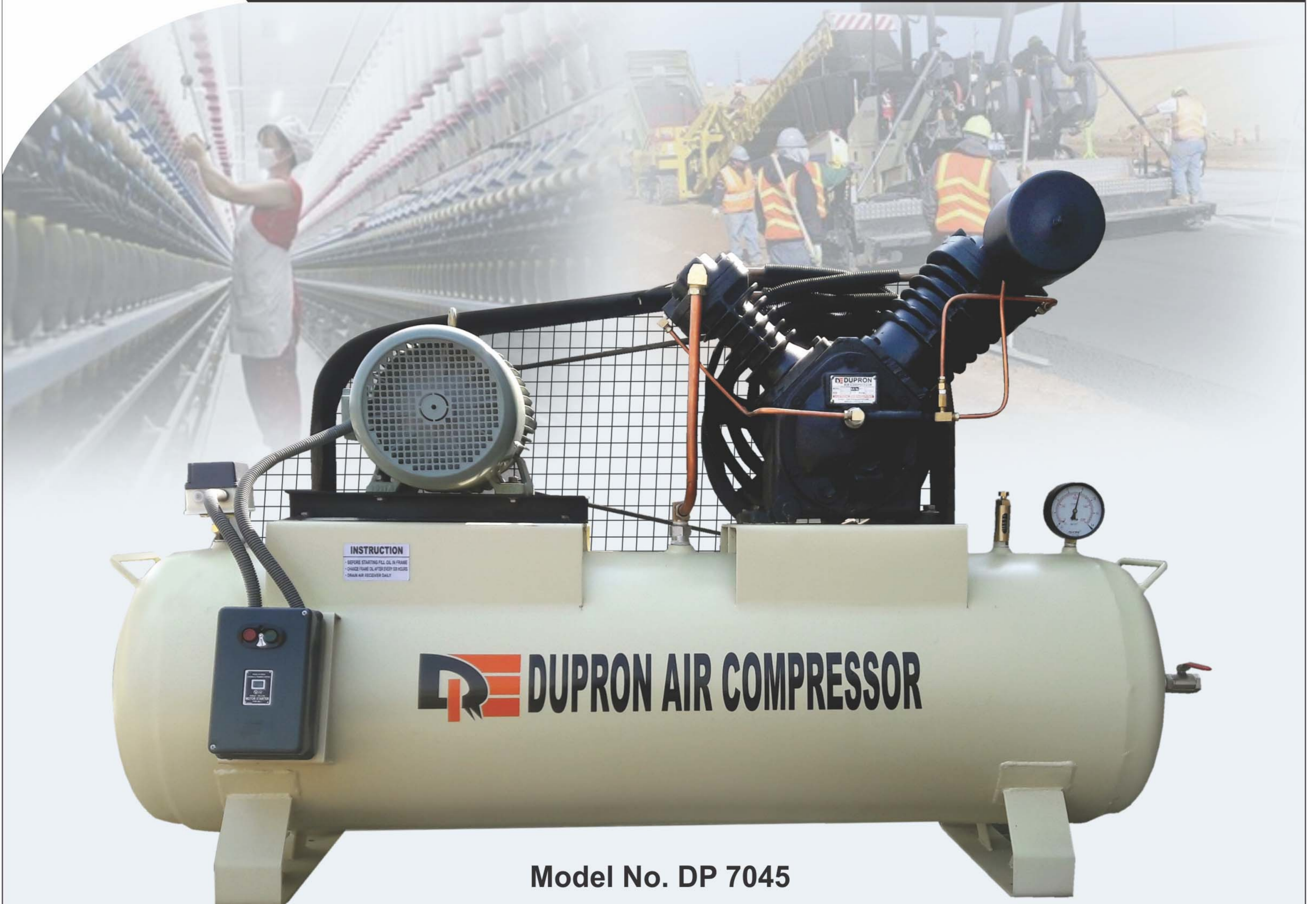
Model No. DP 7045