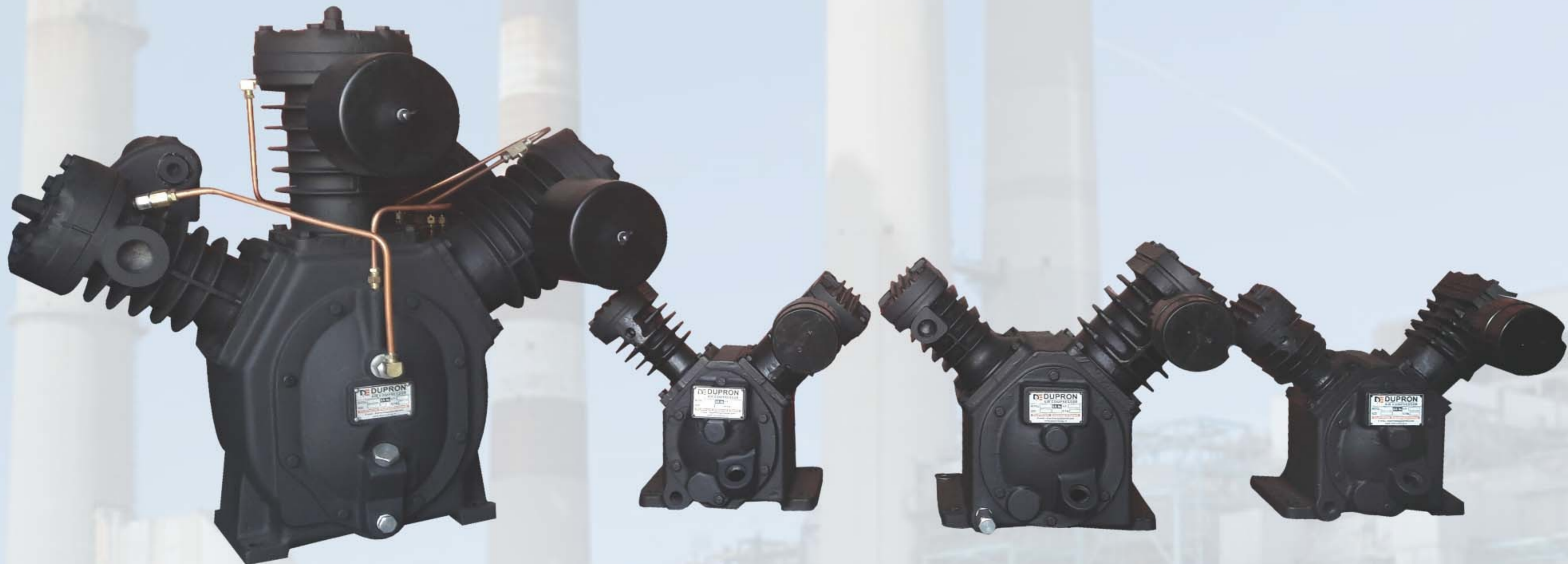
Compressor Bare Block