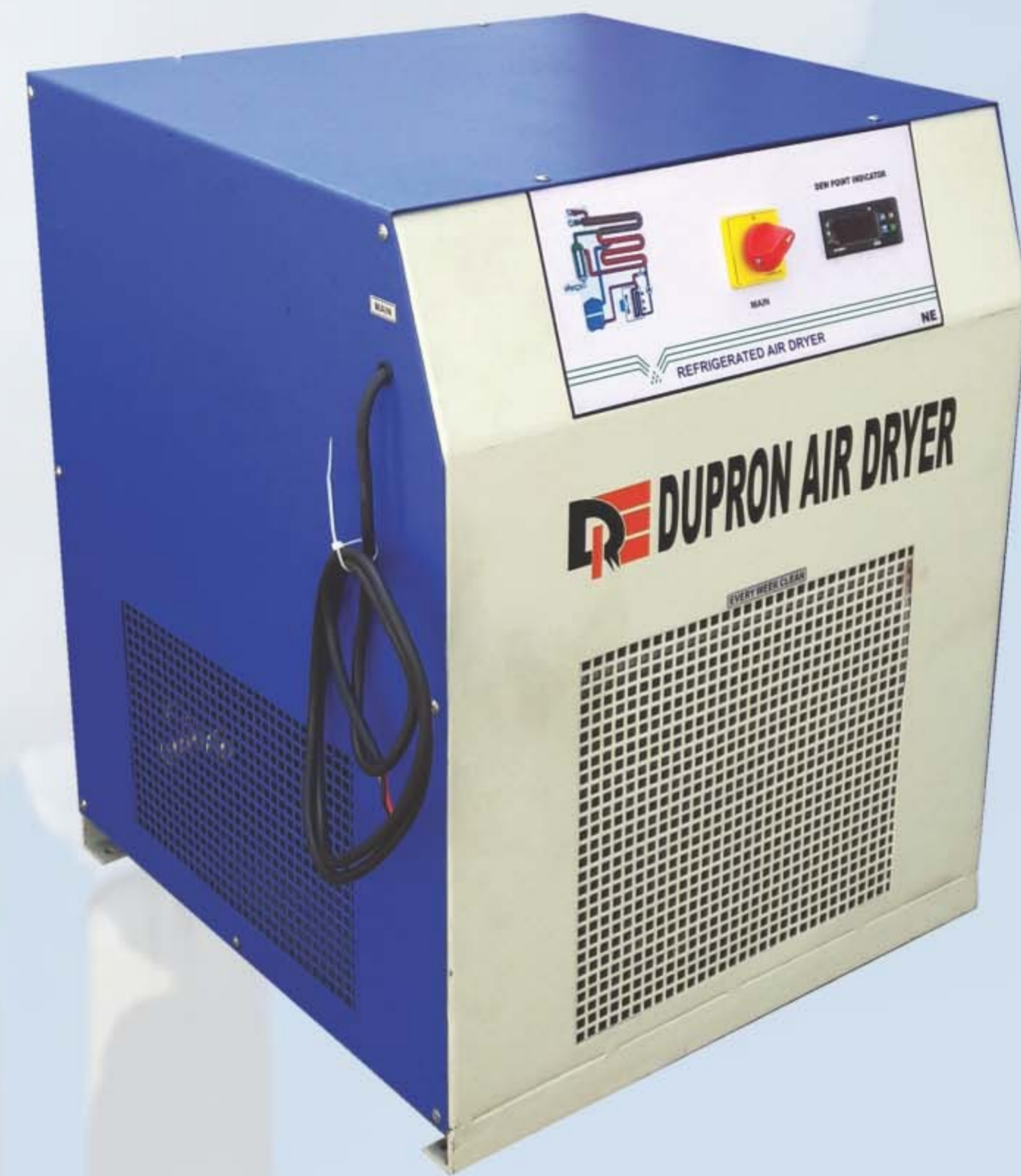
Refrigerated Air Dryer