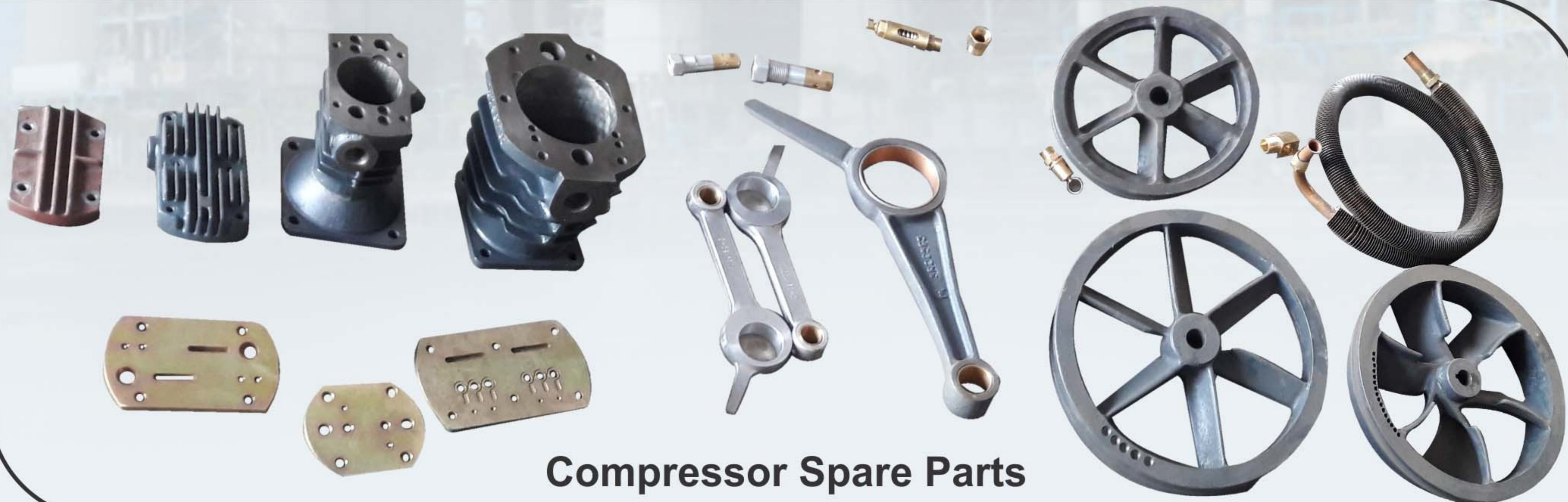
Compressor Spare Parts