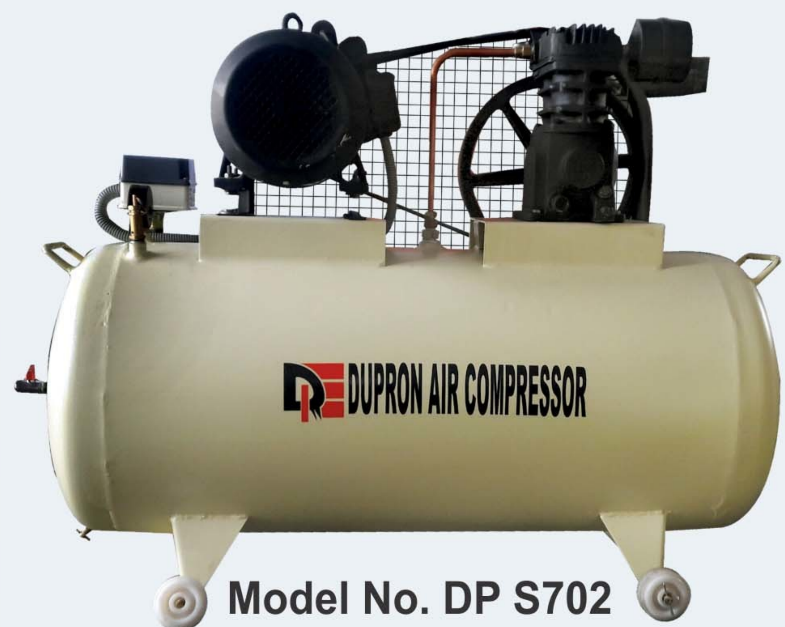
Model No. DP S702