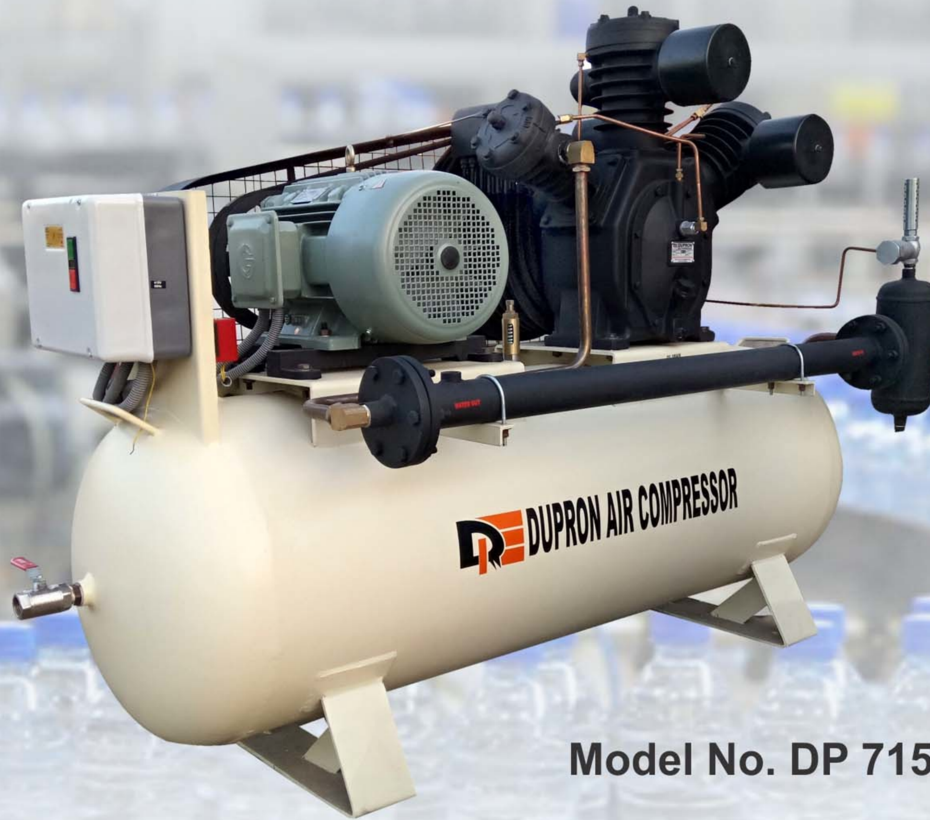
Model No. DP 715TH