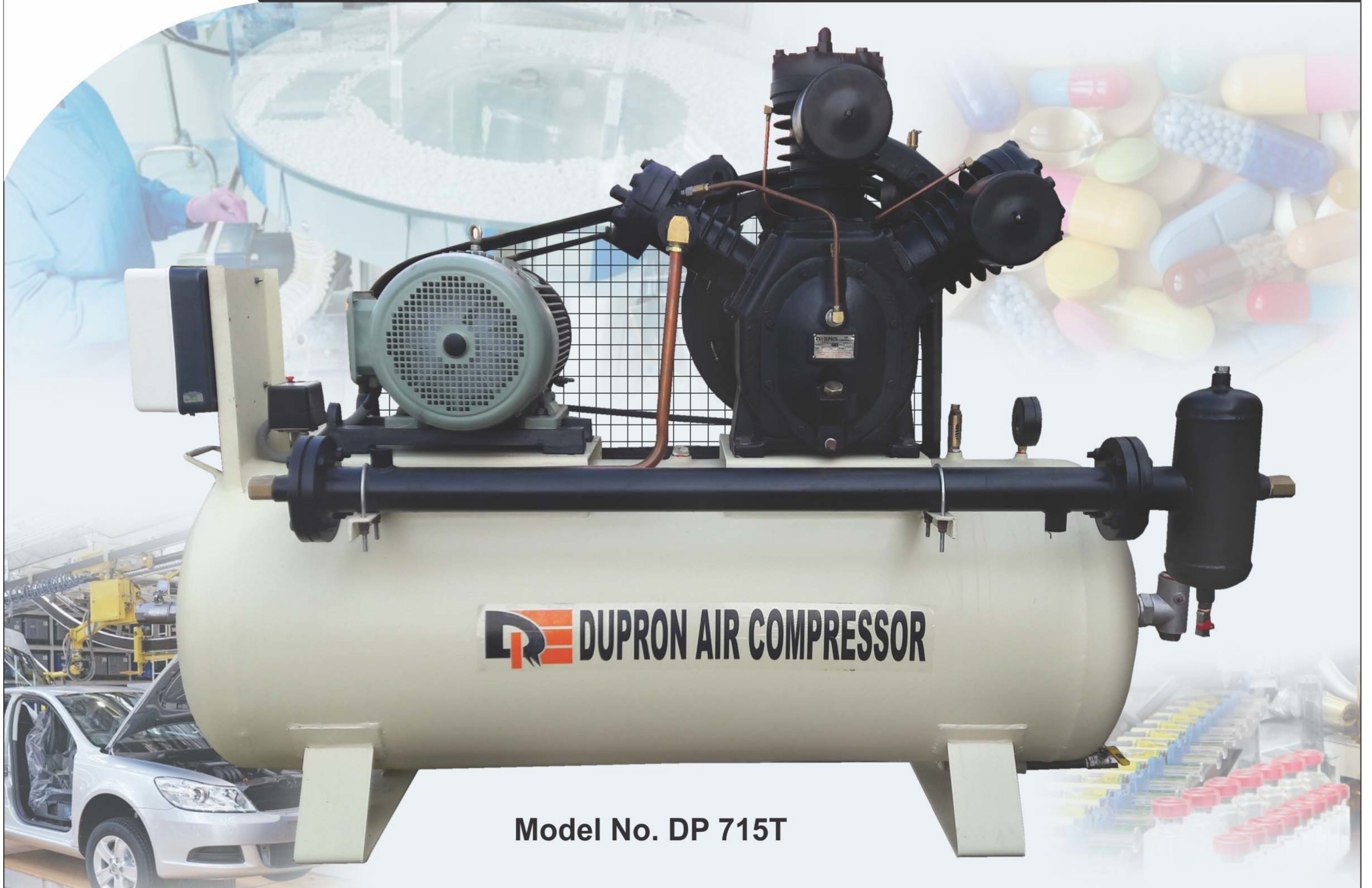
Model No. DP 715T