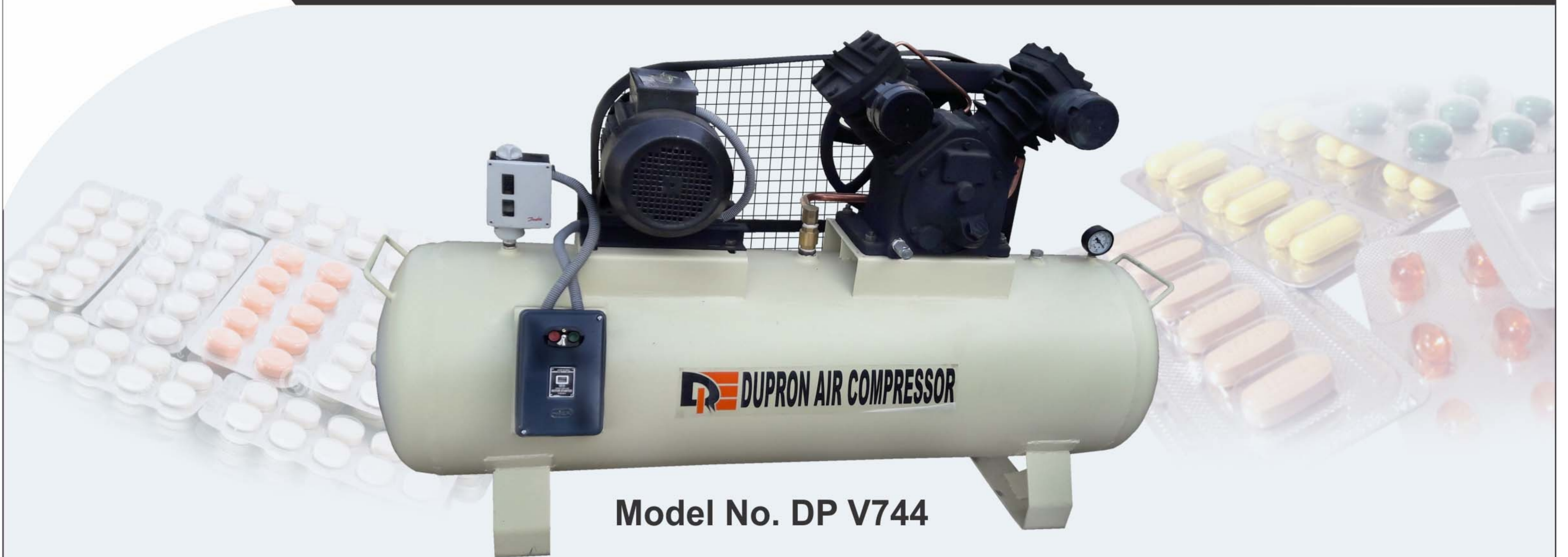
Model No. DP V744